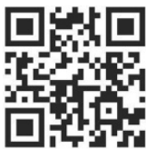
AGWT Events Page

This webinar will provide information to help decision-makers deal with the challenges of health issues, regulations, remediation options and infrastructure costs.