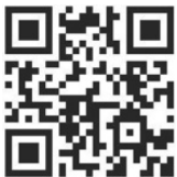
AGWT Events Page

This webinar will provide information to help decision-makers deal with the challenges of health issues, regulations, remediation options and infrastructure costs.