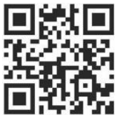
AGWT Events Page

This webinar will provide information to help decision-makers deal with the challenges of health issues, regulations, remediation options and infrastructure costs.