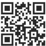
AGWT Events Page

This webinar will provide information to help decision-makers deal with the challenges of health issues, regulations, remediation options and infrastructure costs.