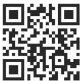
AGWT Events Page

This webinar will provide the latest PFAS information to help decision-makers deal with the challenges of health issues, regulations, remediation options and infrastructure costs.