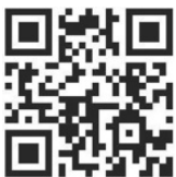
AGWT Events Page

This webinar will provide information to help decision-makers deal with the challenges of health issues, regulations, remediation options and infrastructure costs.