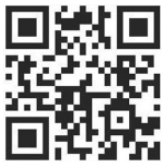
AGWT Events Page

This webinar will provide information to help decision-makers deal with the challenges of health issues, regulations, remediation options and infrastructure costs.