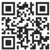
AGWT Events Page

This webinar will provide information to help decision-makers deal with the challenges of health issues, regulations, remediation options and infrastructure costs.