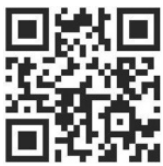
AGWT Events Page

This webinar will provide information to help decision-makers deal with the challenges of health issues, regulations, remediation options and infrastructure costs.